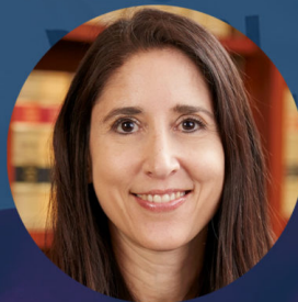
Associate Justice Patricia Guerrero