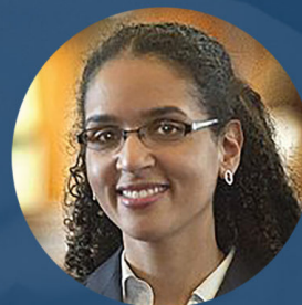
Associate Justice Leondra R. Kruger