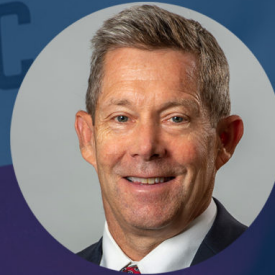
Chief Judge U.S. 6th Cir. Jeffrey Sutton