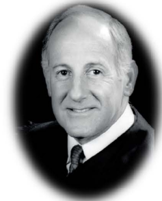
Ronald M. George May 1996–January 2011