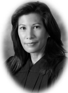
Tani Cantil-Sakauye January 2011-Present