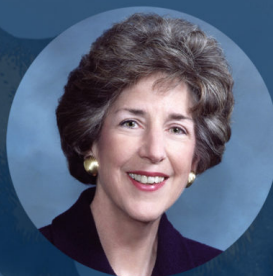
Associate Justice Carol A. Corrigan