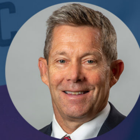
Chief Judge U.S. 6th Cir. Jeffrey Sutton