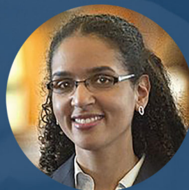
Associate Justice Leondra R. Kruger