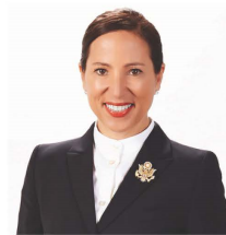
ELENI KOUNALAKIS, CALIFORNIA LIEUTENANT GOVERNOR