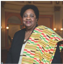
SHIRLEY N. WEBER, CALIFORNIA SECRETARY OF STATE